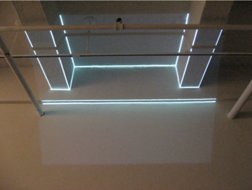
Installation view at LMAKprojects