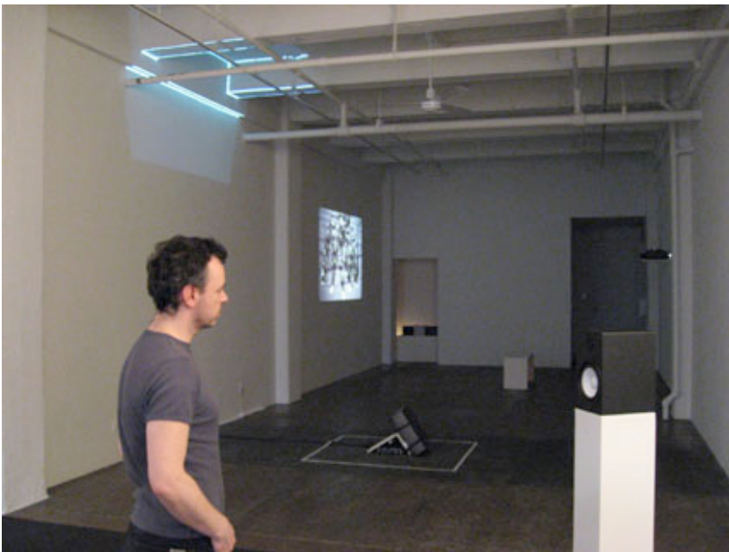
Installation view at LMAKprojects